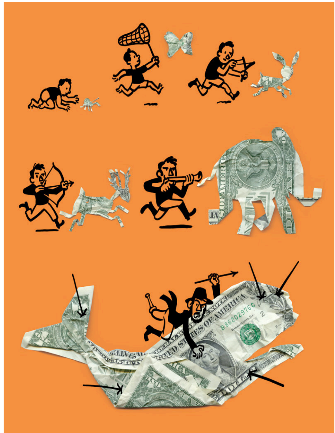
"In Pursuit of Happiness" by Christopher Niemann for The New York Times , May 2, 2012